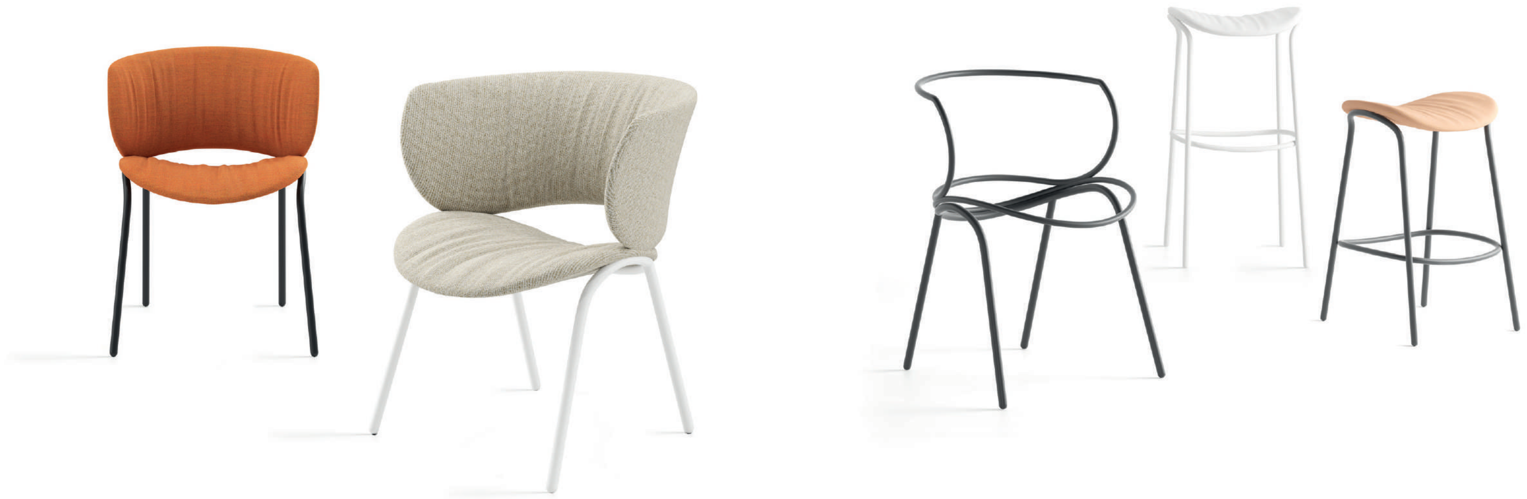
Funda family composed of a chair, a lounge chair and stools with bar and counter height in black and white structures

The commitment to maximum sustainability and comfort shapes Funda, a new range of seats conceived by the outstanding designer Stefan Diez.