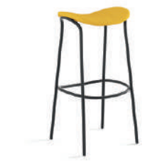
Funda bar stool metal legs