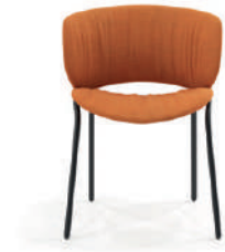
Funda chair 4 metal legs