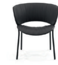
Funda armchair 4 metal legs