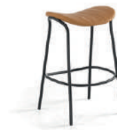
Funda counter stool metal legs